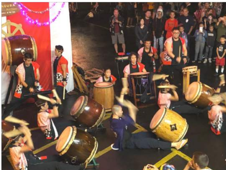
Performance by Taishoji Taiko at Bon Dance