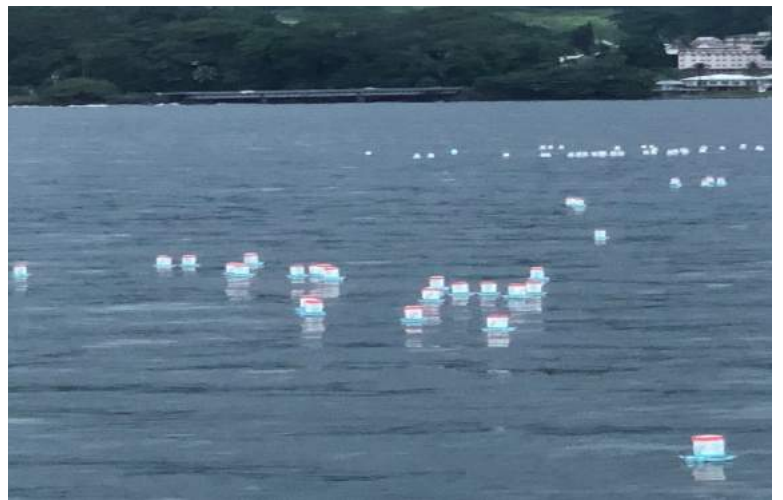
Ancestors going home to the other shore