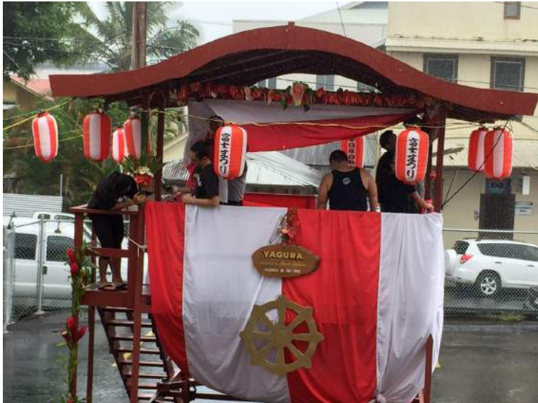
Preparation for Bon Dance