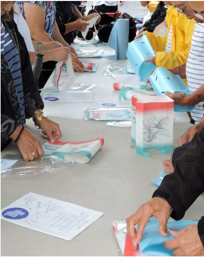
Folding Lanterns for Ancestors