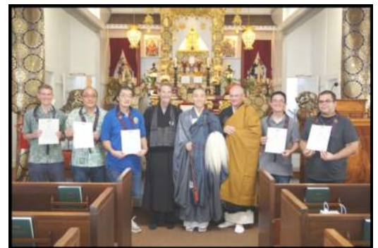
Lay Confirmation Ceremony