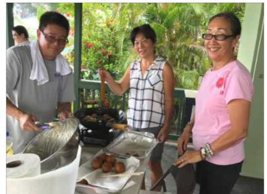
Undagi for dessert at picnic