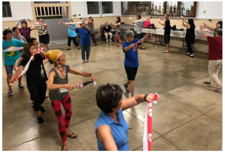
Bon Dance Practice