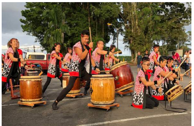
Performance by Taishoji Taiko at Toro Nagashi